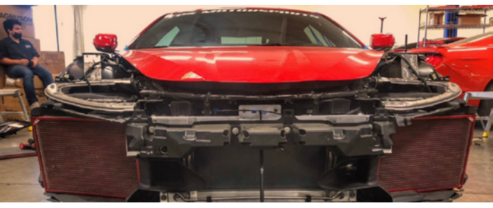
C8 Corvette with front fenders, bumper, & lights removed for Lambo Door Install. TPS C8 Radiator Screens installed