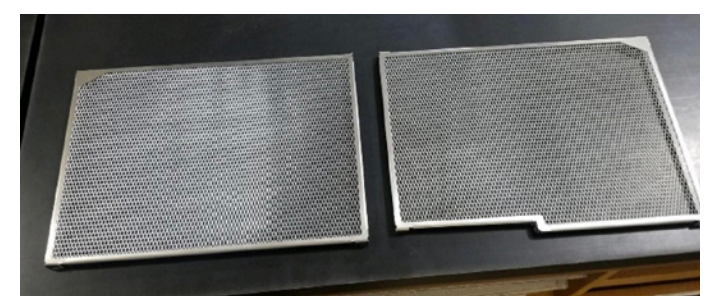
TPS C8 Radiator Screens