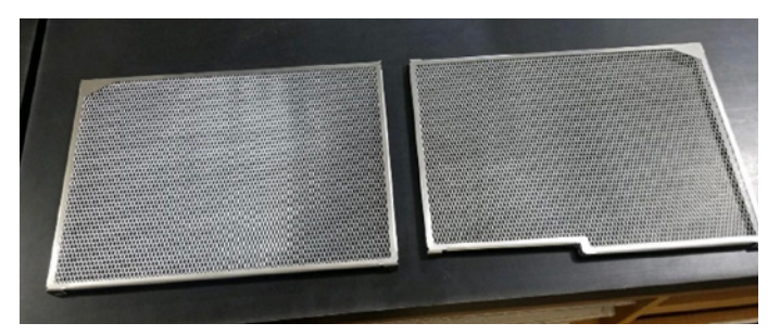
TPS C8 Radiator Screens