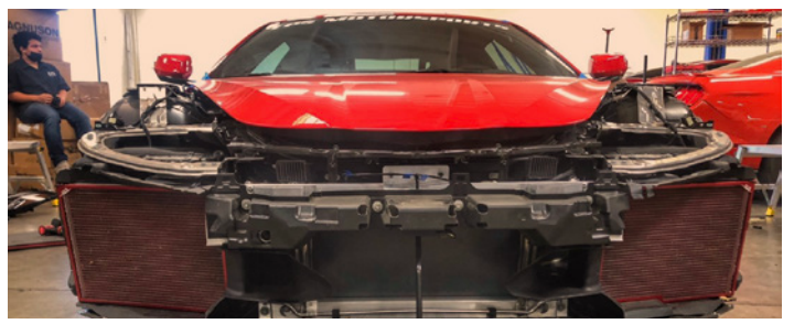
C8 Corvette with front fenders, bumper, & lights removed for Lambo Door Install. TPS C8 Radiator Screens installed